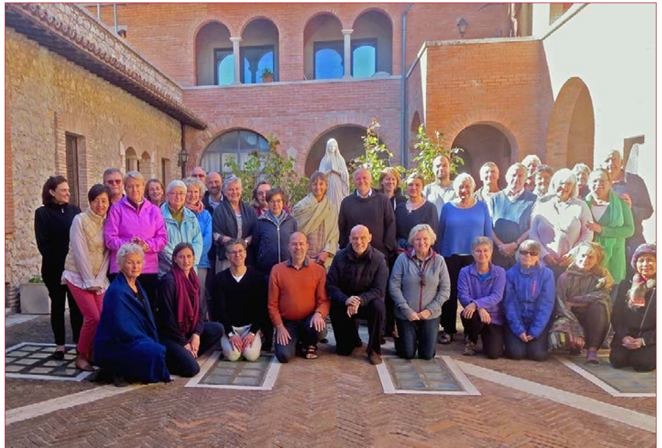
Group photo at the School of Meditation Retreat in Italy

catch up with each other. Our home for this week, Fara Sabina, is an ancient monastery of Poor Clare nuns. For centuries prayer as a supreme priority of life has been lived and nurtured here. I think