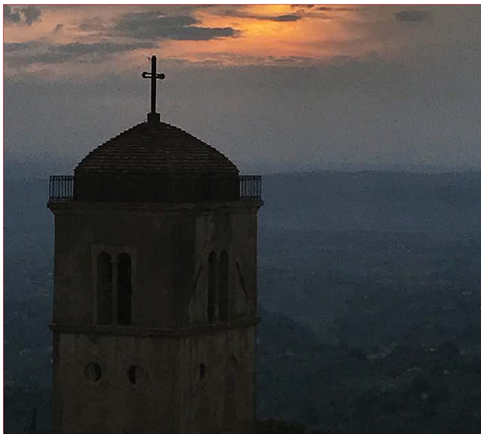
Fara Sabina, Italy

Laurence Freeman shares the conferences from the latest School Retreat, on the different aspects of contemplation